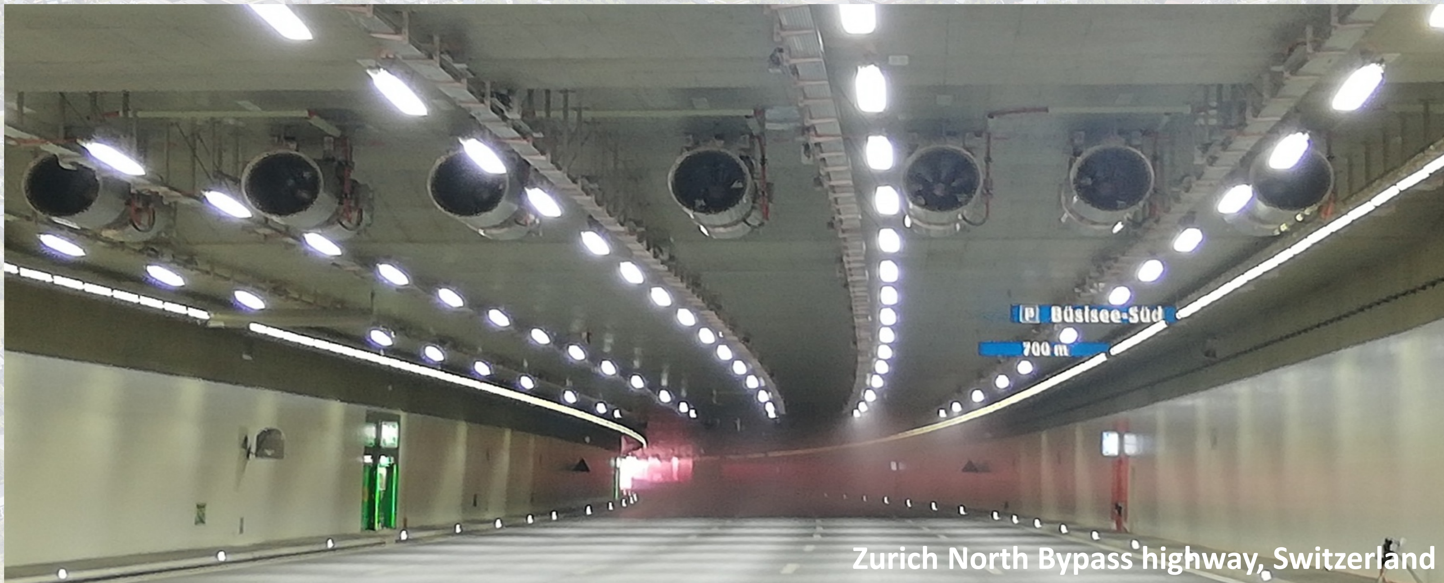
Zurich North Bypass highway, Switzerland